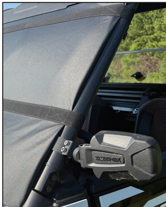
Straps Wrapped Around the Roll Cage