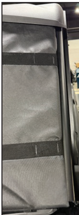
Straps Wrapped Around Windshield Frame